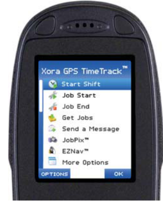
Capture shift and job information on GPS-enabled devices